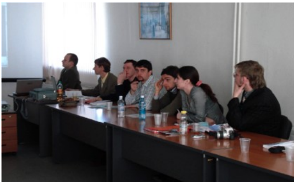
Panel discussion session at SIBCON2009.

Further information about SIBCON can be found at http://www.comsoc.org/tomsk/sibcon/