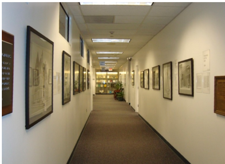
The hallways of the operations center are like a museum of engineering.

The first stop on our tour was the IEEE contact center. The IEEE contact center, with two shifts of multilingual staff is open 120+ hours per week with an average response time to members' questions through e-mail of about 1 to 2 days. The contact center, along with other units of IEEE, also has an emergency plan. That is, in case the building needs to shut down, the staff members can continue their work from home or off site to maintain the good quality of the service for the IEEE members. More information about the IEEE contact center is available at: www.ieee.org/contactcenter .