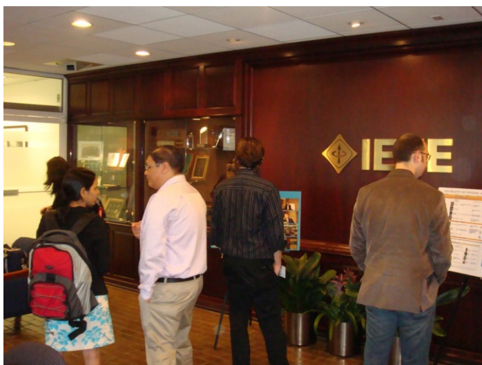
The lobby of the IEEE Operations Center in Piscataway, NJ, USA.

The next stop on the tour was the IEEE command center. Sadly no picture taking was allowed in this facility and very few people have permission to enter it. The main room of the command center was like the inside of a space craft in a sci-fi movie. The command center had a huge desk lined with computers and two whole walls lined with TVs and monitors along with wall clocks on the opposite wall displaying time in various parts of the world. These computers monitor every activity on IEEE servers as well as building security. In addition a TV screen is tuned to world news 24-7 to watch for any natural disasters, emergencies or technology news stories that might affect IEEE in any way or