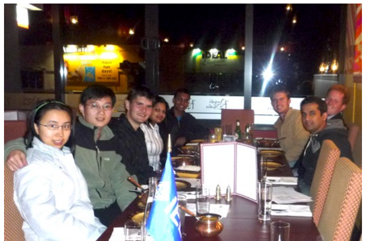
GOLD members and potential members at the induction dinner.

students make the move from an academic environment to a professional one. It aims to aid members' professional development by offering training in leadership and time man-