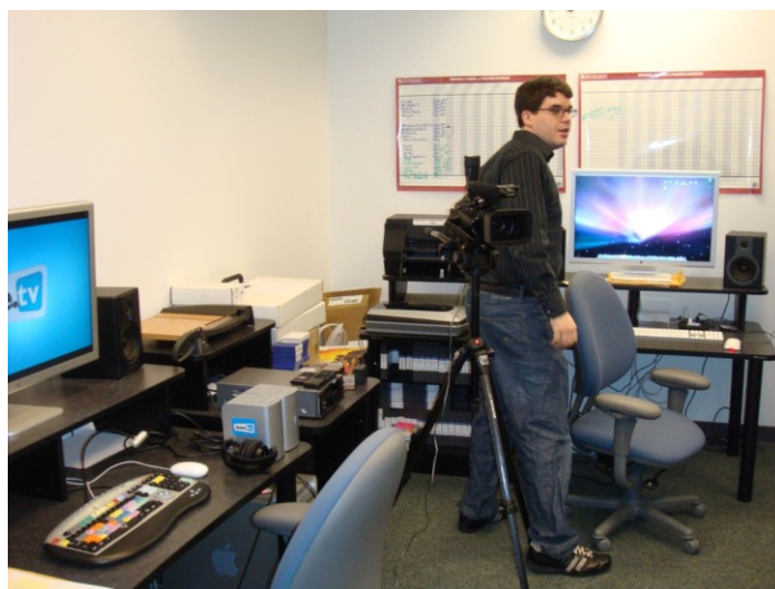
The IEEE TV studio.