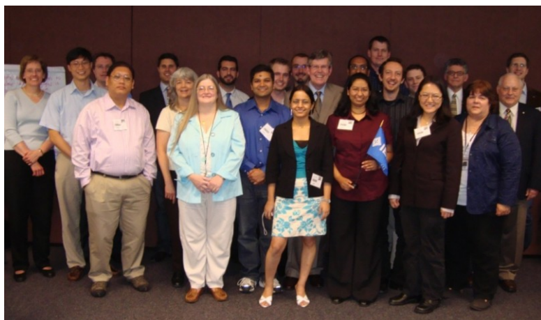
MGA GOLD Committee at the 2009 GOLD Annual Meeting in New Jersey

I am privileged to be part of the IEEE and to have the opportunity to work with so many great volunteers from around the world. In mid-May 2009, the GOLD Committee had its two-day annual meeting in New Jersey, USA. In attendance were GOLD representatives from various Regions and Societies, as well as GOLD representatives on IEEE Major Boards and Committees, IEEE staff members, and senior volunteers.