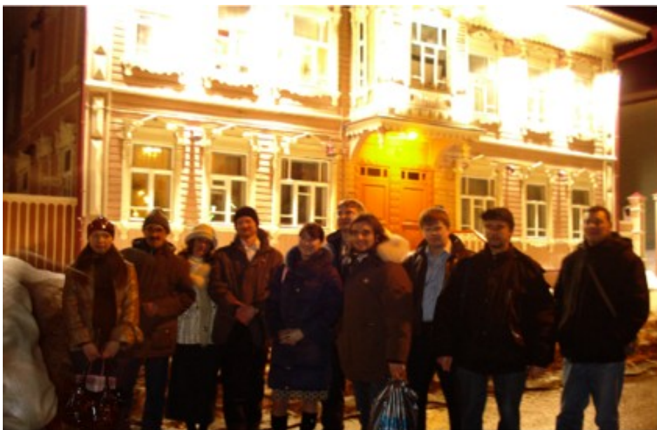
GOLD Members sightseeing in Tomsk in Siberia, Russia

The technical program was divided into several oral sessions on contributed papers. Conference attendees discussed many papers on a wide range of scientific topics. The main aim of the conference was to bring together researchers from various fields in order to present advances in state-of-art theory and