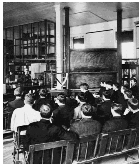
An Electrical Engineering class at Cornell in the late 19th Century [3]

The Darmstadt University of Technology started the first faculty and study course in Electrical Engineering in 1882, followed by the Massachusetts Institute of Technology (MIT) in the same year and Cornell University in 1883 [2]. Many of these programmes included relatively little electrical content and contained considerable amounts of humanities and social sciences. In fact at MIT it was compulsory to study German, as this was the lingua franca for much Electrical Engineering