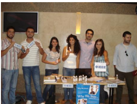
Pictured: AUB Student Branch Committee and Volunteers