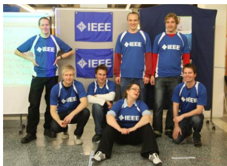
Pictured: The organizing team