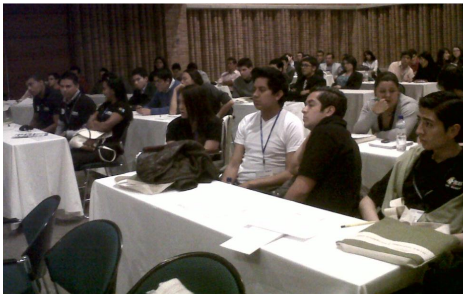
Pictured: GOLD Summit attendees

Keeping in mind the vision that nowadays IEEE is working on, advancing technology for the humanity, the organization included "IEEE humanitarian technology