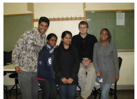
Pictured: Group of IEEE members and final year electrical engineering students.

rail and Eskom for the heavy current students as well as representatives from the South African Institute of Electrical Engineers (SAIEE). Some 60 students, 5 staff from the electrical engineering department and 13 industry guests enjoyed the interactions over good food and drink.