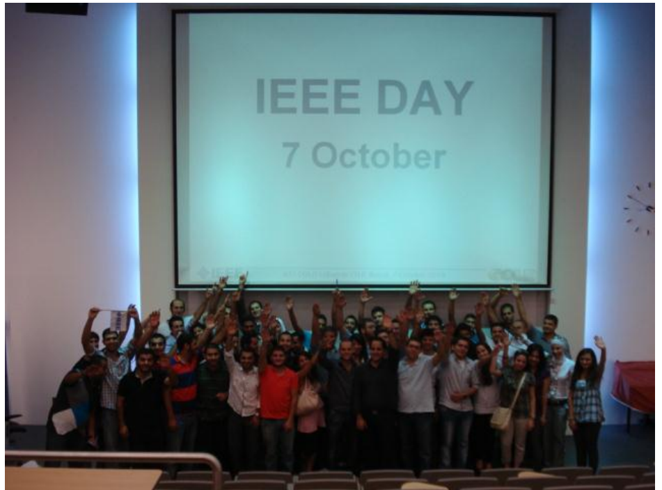
Pictured: Local organizing committee preparing for the event

The STEP event is a standardized yet localized program for facilitating the transi-