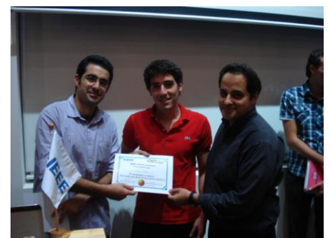
Pictured: Graduate IEEE member receiving his Award