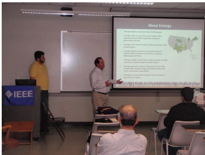
Pictured: STEP Event at Baton Rouge, Louisiana, USA