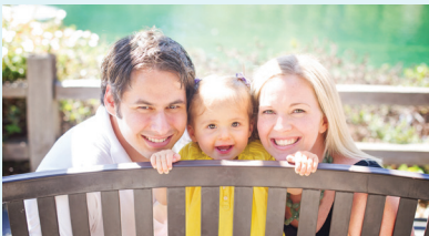
Mental Health & Addiction Services