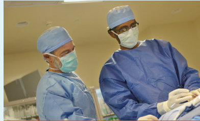
Norma Melchor Heart & Vascular Institute