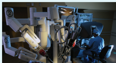
Innovation in Care