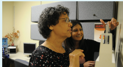
Disease Prevention & Education