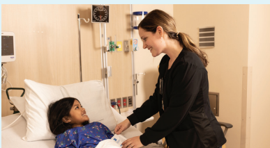
Nursing Excellence & Education