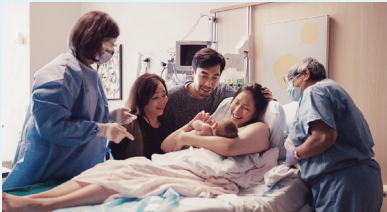
Healthy Babies & Families