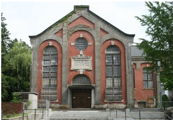
Keage Power Station The 2nd phase building constructed in 1912

Keage Power Station and Lake Biwa Canal Museum: Keage hydroelectric power station started its operation in 1891 as the first hydroelectric power station for electric utility services in Japan utilizing water through Lake Biwa Canal which was completed the previous year. The first tramcars in Japan ran in Kyoto by electricity generated here in 1895. The classical red brick building constructed in 1912, still remains. The existing power station was constructed in 1936 and has been working until now. You can see the history of the construction of the canal and power station at the Lake Biwa Canal museum nearby.