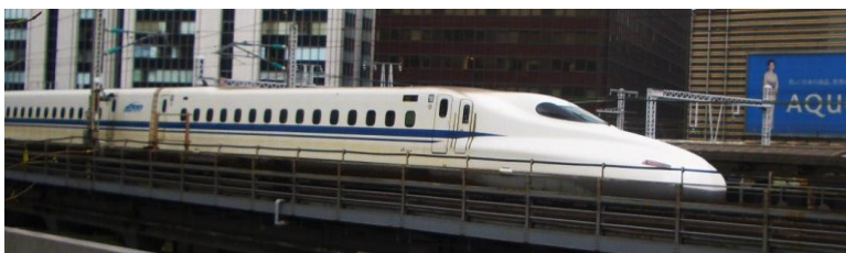
Shinkansen “NOZOMI” approaching Tokyo station

Shinkansen to Tokyo : You will ride on the Shinkansen from Nagoya station to Tokyo station. Please watch the automatic ticket examining system (IEEE Milestone) working. On the train, the first class seat is prepared for you. Enjoy the full view of Mt. Fuji on the way!. You will be at Tokyo station after 103 minutes ride, then to the Prince Sakura Tower where you will stay 4 nights.