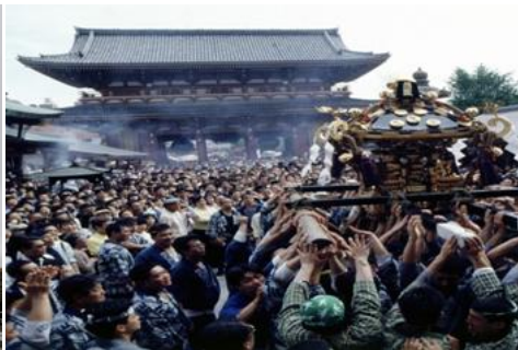
Senso-ji in Asakusa