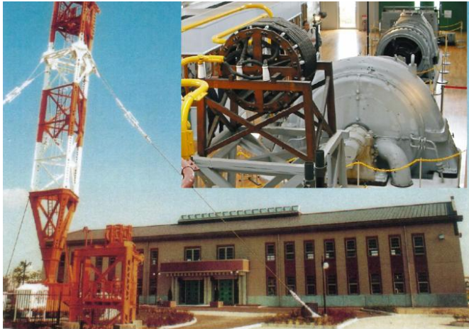
Yosami Memorial Museum High frequency alternator and the base of antenna

TOYOTA Commemorative Museum of Industry and Technology : It is located on the site where Sakichi Toyoda, founder of the Toyota Group, established his plant for developing automatic looms in 1911. Its main exhibits consist of two pavilions: textile machinery and automobile manufacturing accommodated in the original redbrick building, one of the historical legacies of the Toyota Group. Visitors can learn the history of the Toyota Group and see the importance of “Making Things” and “The Spirit of being Studious and Creative”, through hands-on exhibits and demonstrations.