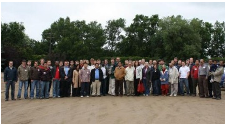
Attendees of the GOLD Industry BBQ 2009

The GOLD committee wishes to acknowledge the generous financial contributions provided by the IEEE STEP program and the IEEE North Saskatchewan Section.