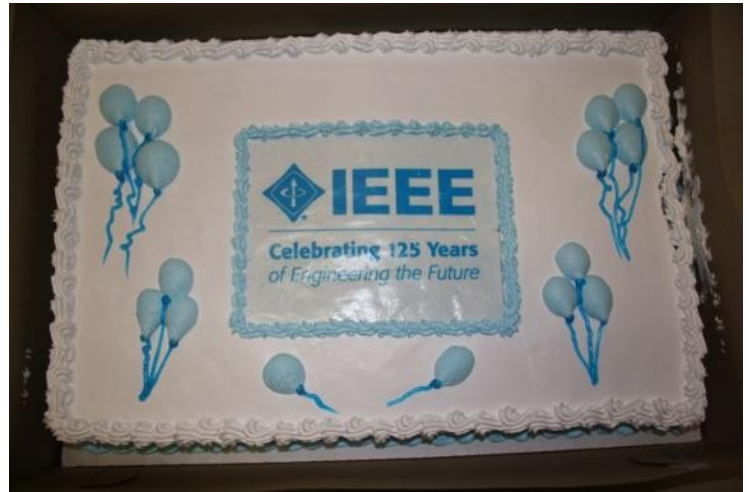
IEEE Commemorative Cake

At least 17 companies and institutions were represented at the BBQ. Company industries included: utilities, education, telecommunications, agricultural instrumentation, software, and consulting. There was a good mix of recent graduates and senior level people attending the event. Several members of the IEEE North Saskatchewan Section Executive were also in attendance representing their respective companies.