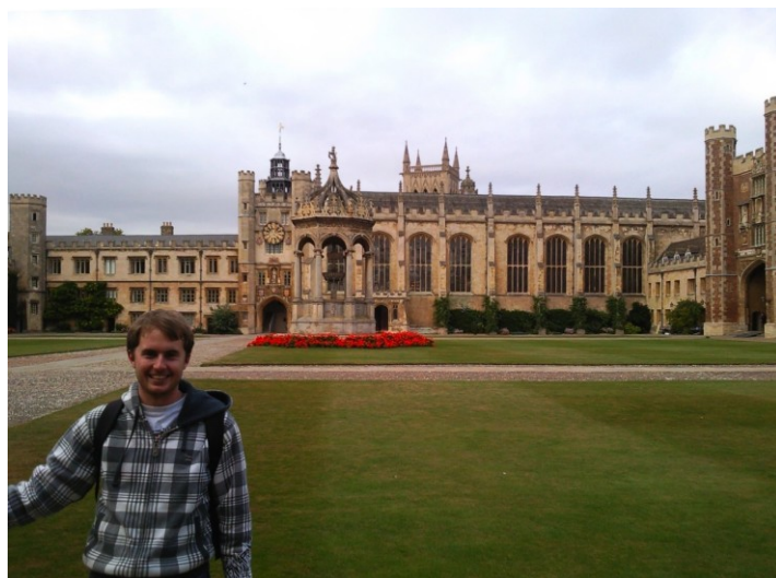
Me in the Great Court, Trinity College, Cambridge

tence and avert catastrophe. A major change must be our first step towards progress. Likewise, if you want to progress in your professional career you will often need to make a change, whether this be achieving better re-