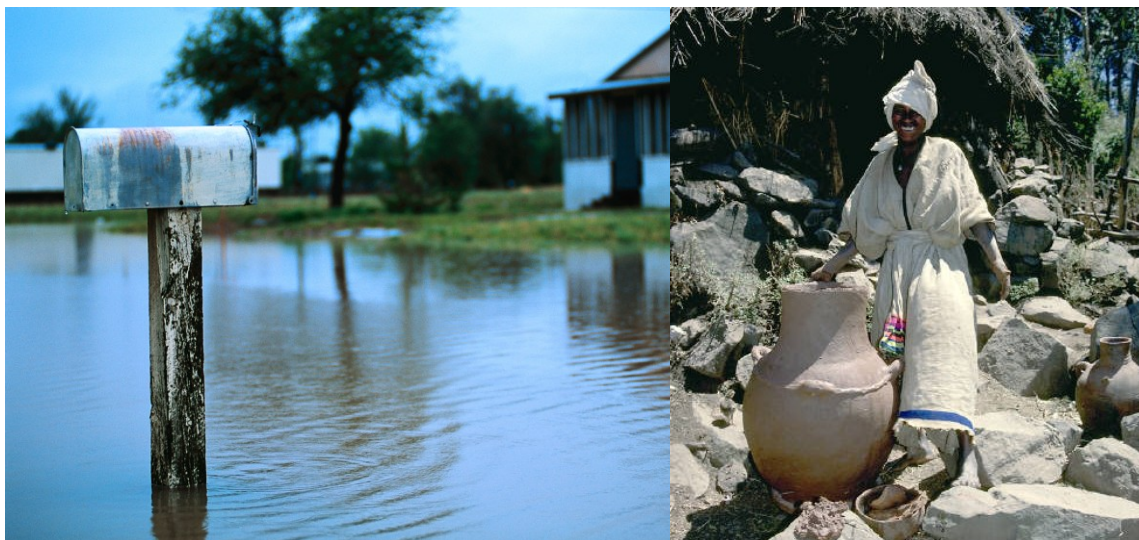
The IEEE Humanitarian Technology Fund, run by the IEEE Foundation, has helped to kick-start many humanitarian projects around the world.

of opportunities to enhance their engineering experience and broaden their involvement in IEEE. In advancing IEEE's core purpose to foster technological innovation and excellence for the benefit of humanity, the Foundation emphasizes projects designed to improve people's lives worldwide. Graduates of the last decade are particularly valuable to these humanitarian initiatives.